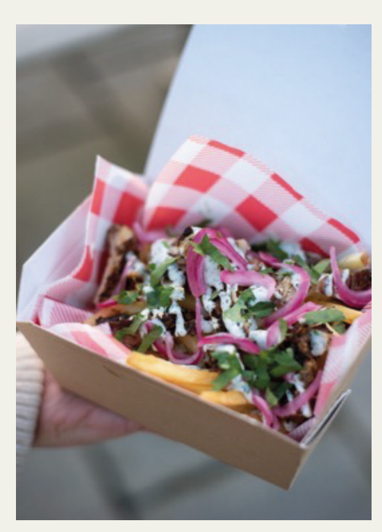
Classic Poutine (v) Burnt ends, hickory mayo, frazzles Melted cheese, jalapeño salsa, sour cream, spring onions, guacamole Crispy lamb, spiced mint yogurt

£9.95 per person Minimum order: 75% of guests