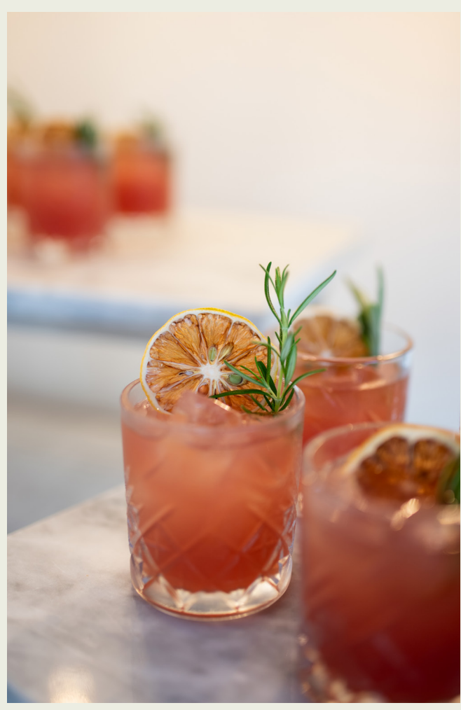
Cranberry Mist Cocktail