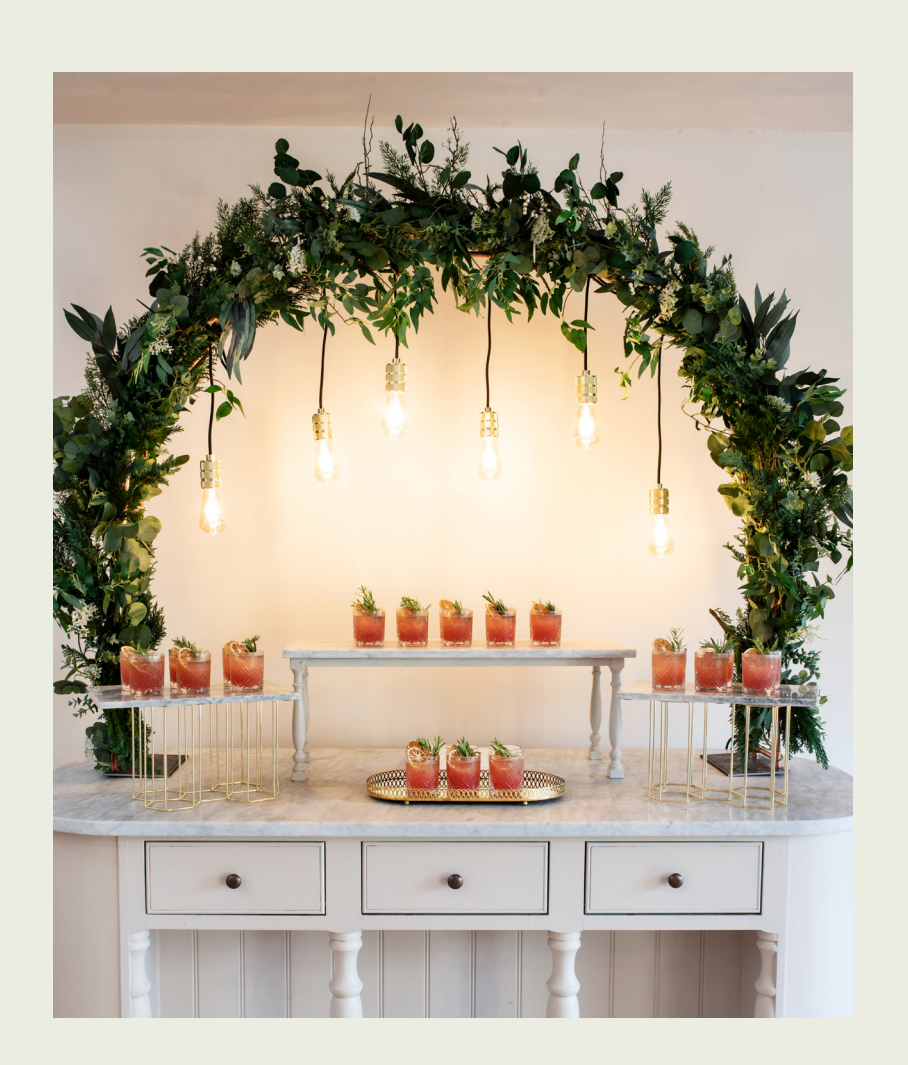
Faux foliage & light bulb archway available on certain drink stations for additional dressing at £95 \,